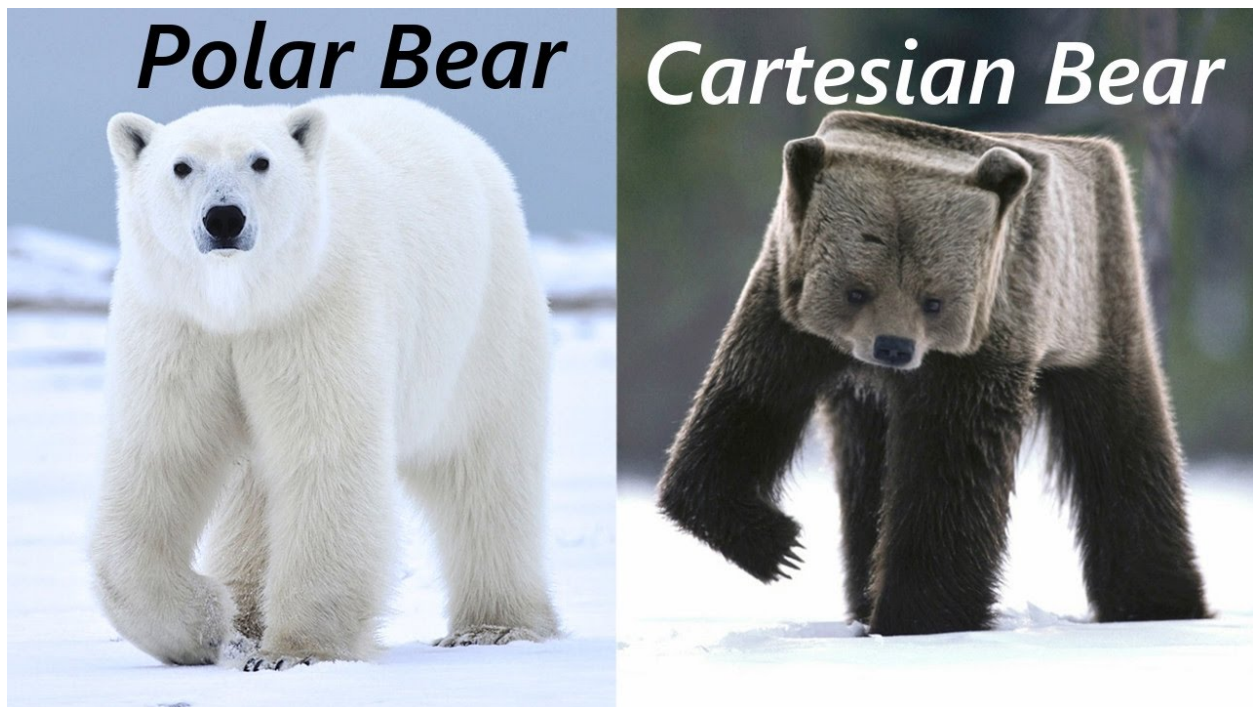
Figure 1: A very nice visualization of the difference between polar and Cartesian coordinates.

Figure 1 illustrates the difference between polar and Cartesian coordinate systems. Make sure to cite the source for figures and pictures that you did not create.