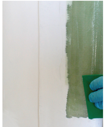
MPS paste is also used to provide a smooth, sandable top surface to the prepreg patch.