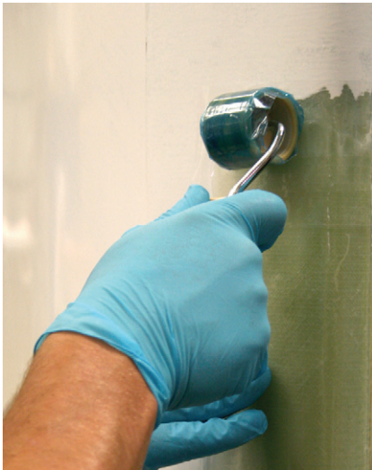
Using the RENUVO system, a prepreg patch is rolled into position using the MPS paste as a 'wetting' layer to the blade surface.