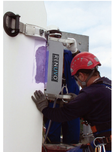
The RENUVO system in use on a blade.

This 'freeze' is, of course, only rotational and as Kane emphasises: "There can still be plenty of flapwise motion, especially on the larger blades in a variable wind.