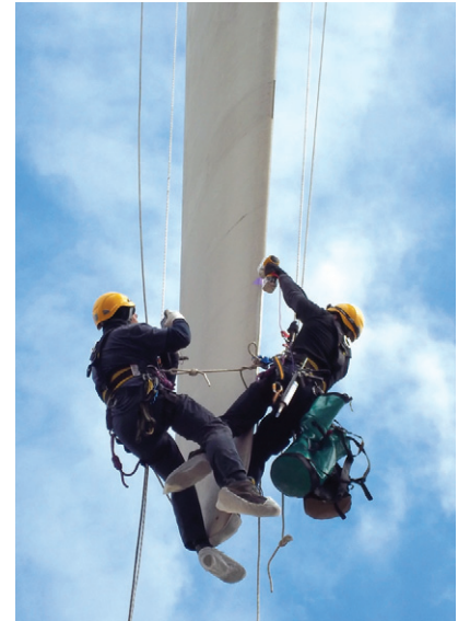
Technicians must inspect, clean and repair the composite rotor blades whose good condition is vital to wind turbine efficiency.