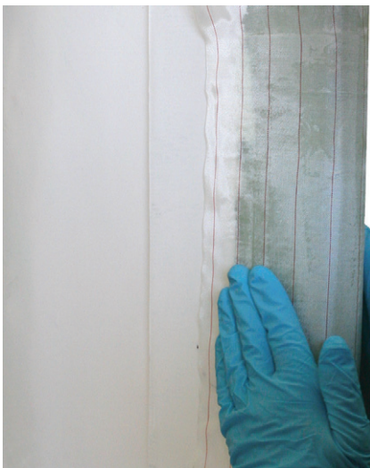
Peelply is applied as a final layer to ensure an even patch surface.