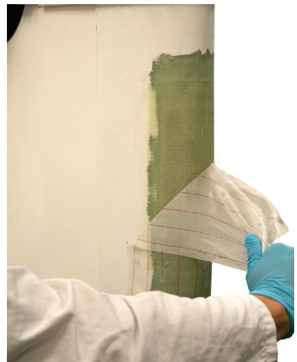
After the UV exposure the patch is completely cured, the peelply can be removed and the repair painted.

up as a prepreg stack to form a composite repair patch. Cripps explained that, by combining RENUVO PP (prepreg) plies appropriately, a patch can be produced that replicates quite closely the mechanical properties embodied in the original undamaged laminate. The MPS resin used in combination with the prepreg acts as the interface to the substrate and can also provide a smooth, easily sandable top surface to the final repair.